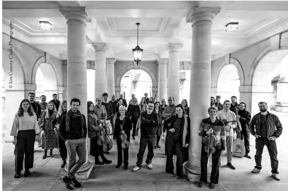
Early Opera Company