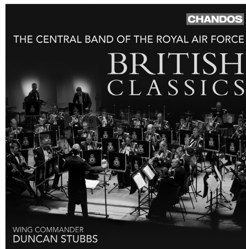
British Classics CHAN 10847