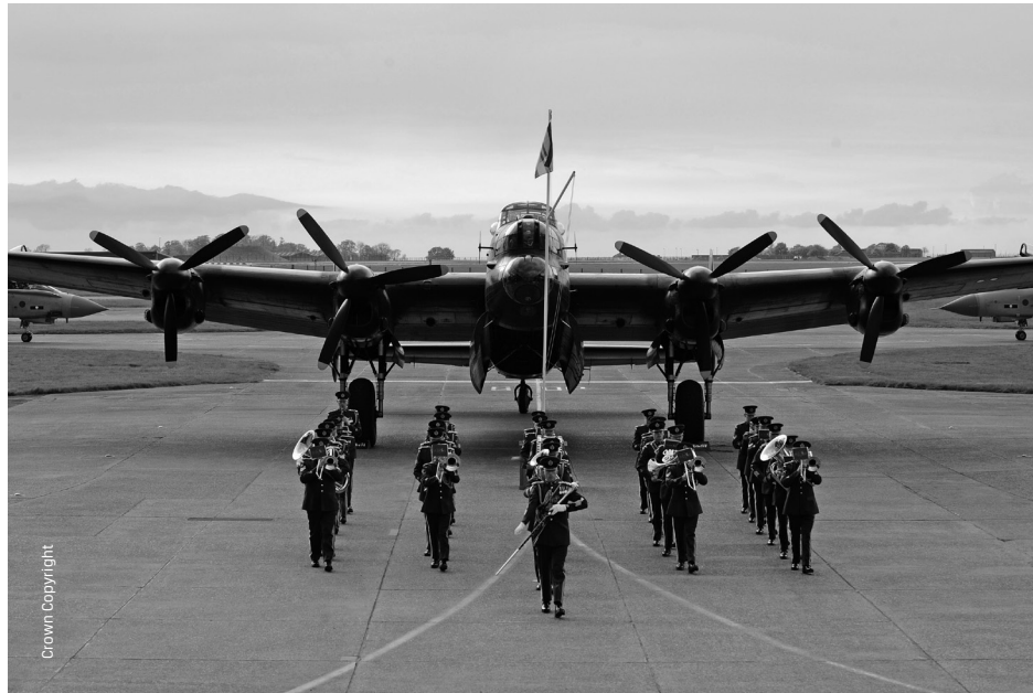
The Band of the Royal Air Force College at RAF Scampton for the 70th Anniversary of the Dambusters