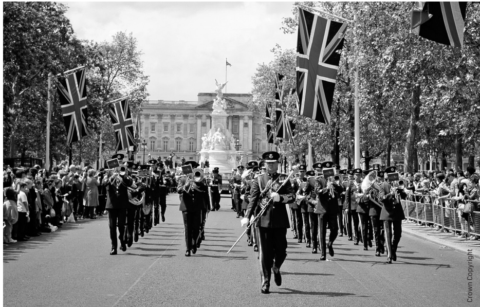
The Central Band of the Royal Air Force, The Mall, London