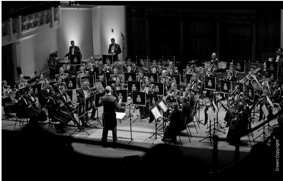
The Central Band of the Royal Air Force, Cadogan Hall, London