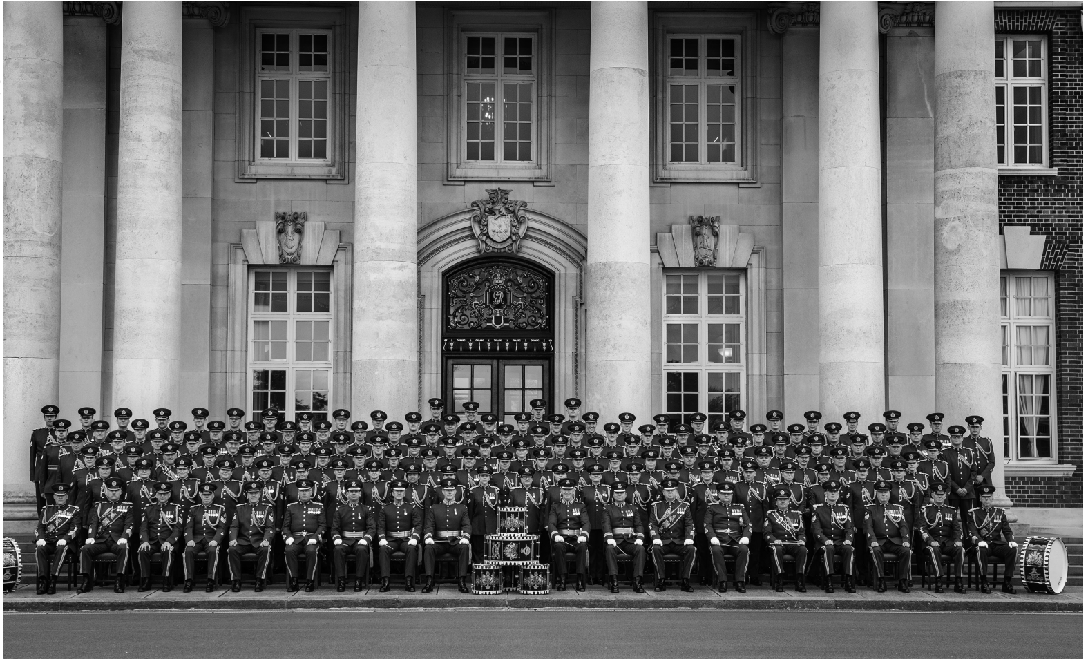
Royal Air Force Music Services at College Hall, RAF Cranwell, 2016