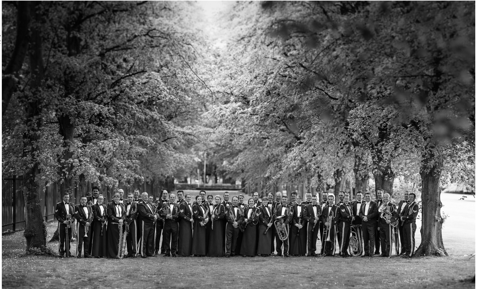
Musicians from the Band of the Royal Air Force College, Cranwell