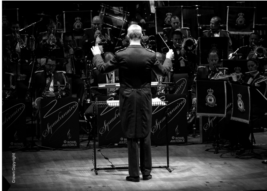
The Central Band of the Royal Air Force in concert