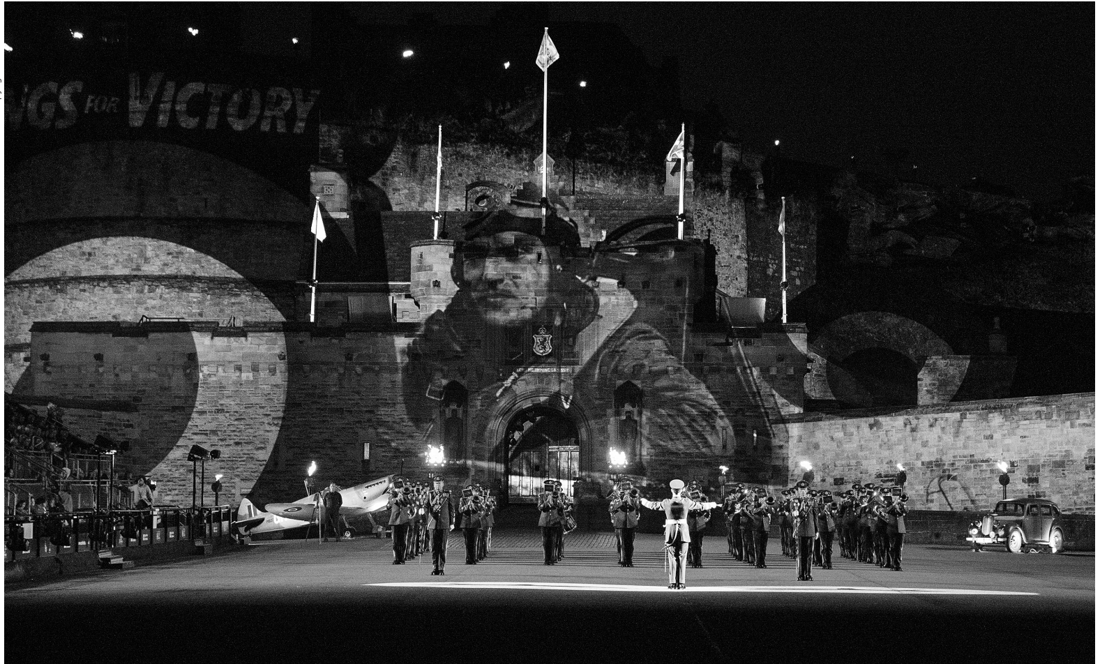
The Band of the Royal Air Force College and the Central Band of the Royal Air Force at the Royal Edinburgh Military Tattoo, commemorating the 75th Anniversary of the Battle of Britain