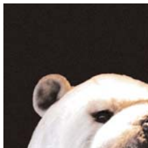
CHANDOS BEAR ESSENTIALS