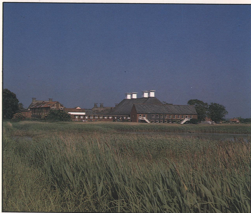
The Maltings, Snape.

© 1986 Chandos Records Ltd. © 1986 Chandos Records Ltd. Printed in Germany/Imprimé en Allemagne. CHANDOS RECORDS LTD., LONDON, ENGLAND.