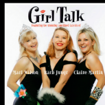
Girl Talk Girl Talk

For even more great music visit linnrecords.com