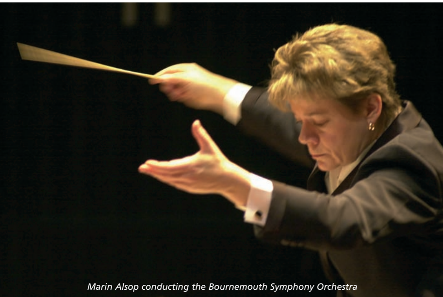
Marin Alsop conducting the Bournemouth Symphony Orchestra