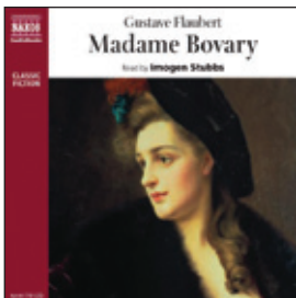
Madame Bovary (Flaubert) ISBN: 9789626341780 Read by Imogen Stubbs