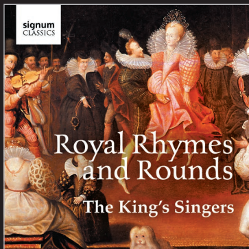
Royal Rhymes and Rounds The King's Singers